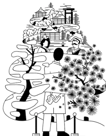
1873 – Japan comes to Europe