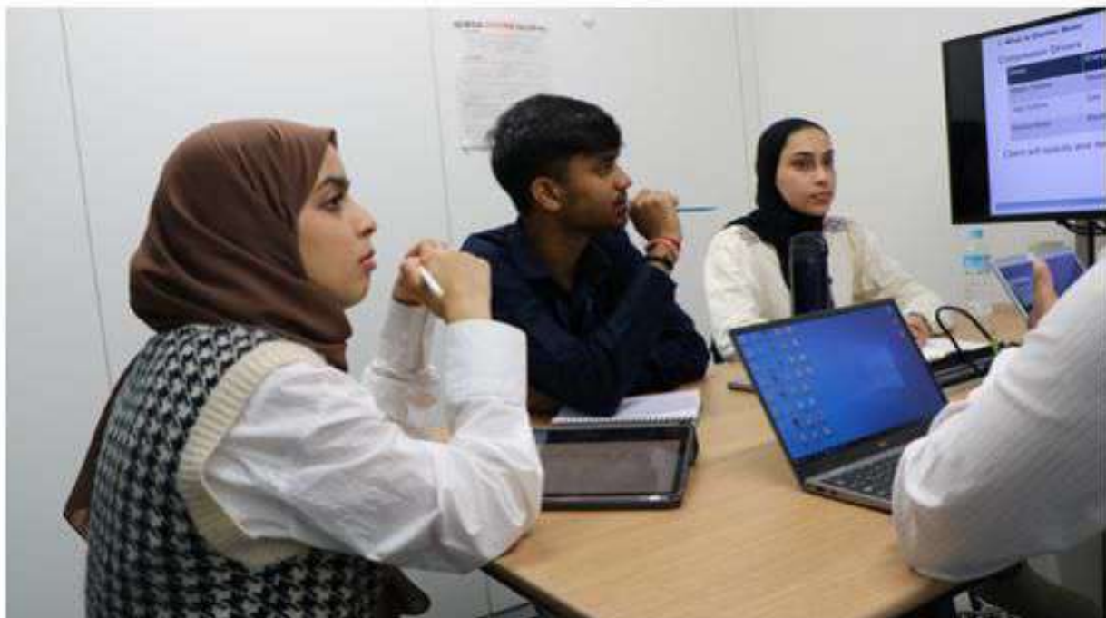
Image 1: Internship Program at Mitsubishi Heavy Industries Compressor Corporation