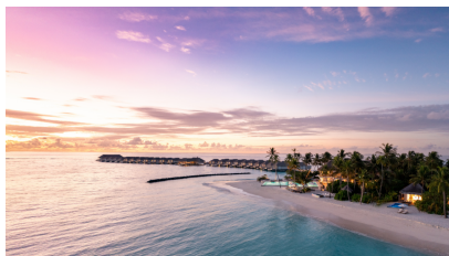
Baglioni Resort Maldives

Make your holiday unforgettable and enjoy precious moments in the Baglioni resort - Maldives.